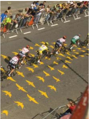
Surface applied graphic