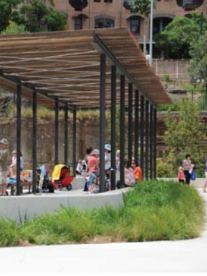
Pirrama Park Pyrmont, Sydney