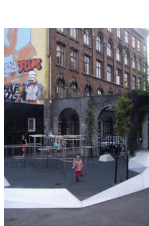
Charlotte Ammundsens Plads 1:1 Landskab, Denmark