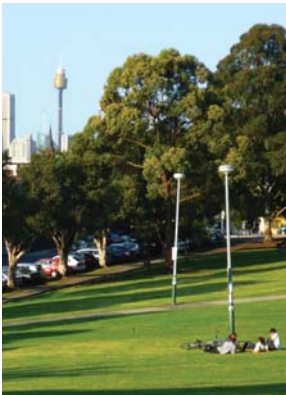
Camperdown Memorial Rest Park Sydney