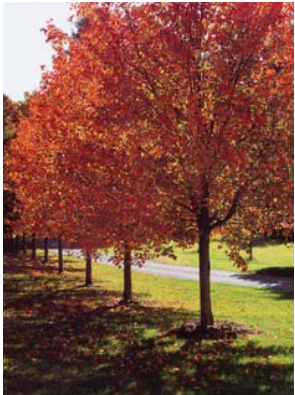
Ornamental deciduous tree