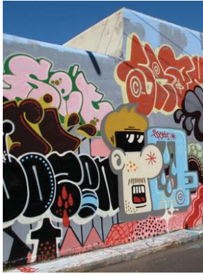
May Lane St Peters, Sydney