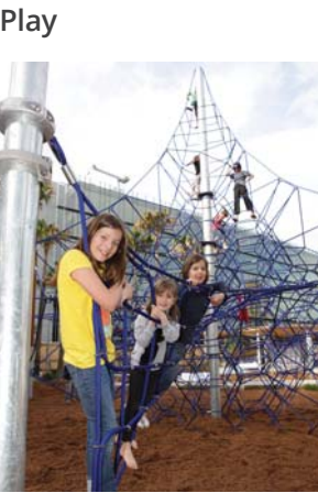
Darling Quarter Aspect Studios, Sydney, Australia