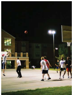
UTA Student Housing Centennial Court Arlington, Texas