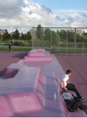
Purple Pleasure Carve Architects, Netherlands