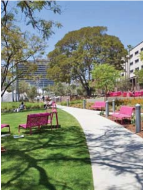
Grand Park, Los Angeles Rios Clementi Hale Studio