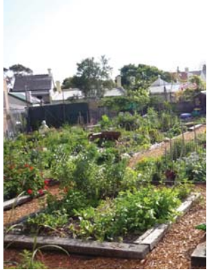
Saint Joseph's Community Garden Newtown, Sydney