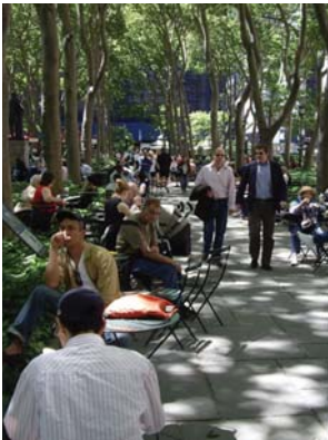
Bryant Park New York